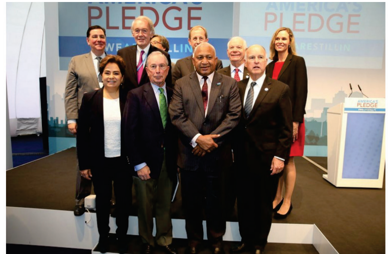
Channel the voice of America's Pledge